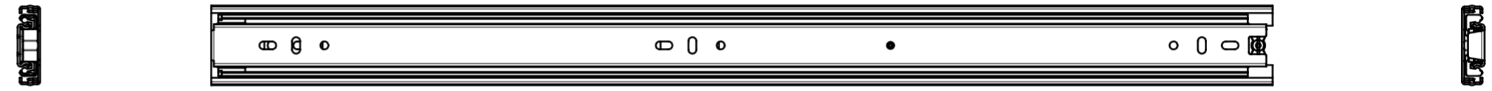
CABINET MOUNTING HOLES